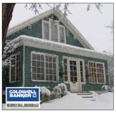
Knowledge makes the difference! Realtor for 13 years. Cambridge resident for 16 years. Call me for all your selling & buying needs.