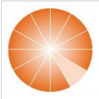
[TC-I Call to Action]: Center for Innovative Financial Design