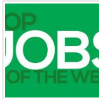
[Jobs Roundup] Greenpeace, SELCO, UnLtd India, 40k and more are looking to hire you