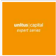
The Social Enterprise Landscape