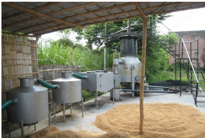
Electricity production in HPS plant

plants" each generating 35 to 100 kilowatts of power. Both these social entrepreneurs have set a precedent which should be followed by youth to solve energy problems of our country.